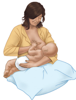
Cradle Hold* (commonly used after the first few weeks)