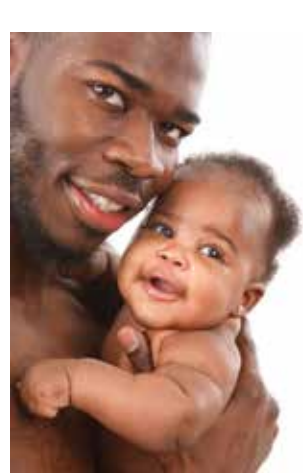
It's great for partners to be skin-to-skin, too!

Some hospitals practice skinto-skin after C-sections in the operating room.