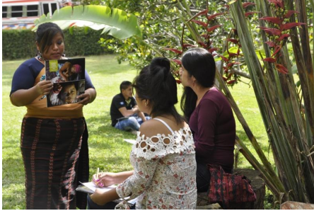
Guatemala Food for the Hungry staff participate in a role-playing exercise during training this past June.

CGBI is continuing to collaborate with Food for the Hungry Guatemala on a new project this year. Building on their previous work together that produced the "Reading and Responding to Your Baby" Care Group module, the new project is focusing on the creation of two additional Care Group modules that incorporate messages about responsive feeding and its importance to early childhood development.