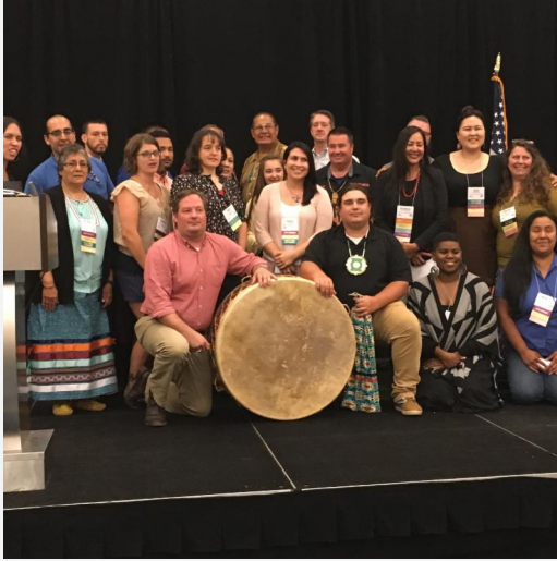
Native American participants at the USBC Conference this past August