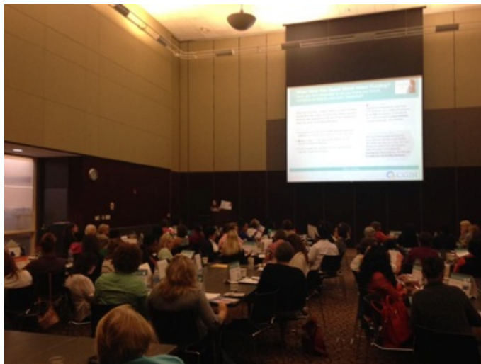
One of the day-long training sessions

CGBI is proud to report that trainings have been completed on Ready, Set, BABY in 4 regions in our state of North Carolina. Evaluations were overwhelmingly positive, and we are excited that many more expecting mothers will benefit from the counseling offered via the curriculum. Further details about the trainings can be found here .