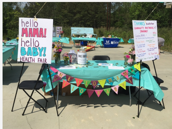
Hello Mama Hello Baby! health fair