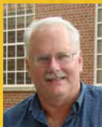
Dr. Ralph Baric

Ralph Baric, PhD, professor of epidemiology at the Gillings School and of microbiology and immunology in UNC's School of Medicine, worked