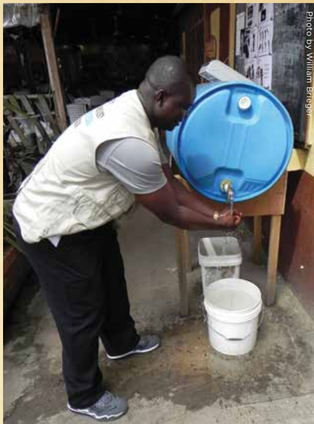
Clockwise from bottom left: At the Connaught Hospital in Freetown, Sierra Leone, makeshift tents are set up for screening people with Ebola symptoms; Burial teams in Sierra Leone follow a strict protocol when putting on their protective clothing; A clinic worker in Liberia sanitizes his hands at a chlorine hand-washing station.