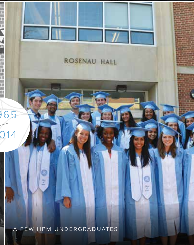
A FEW HPM UNDERGRADUATES