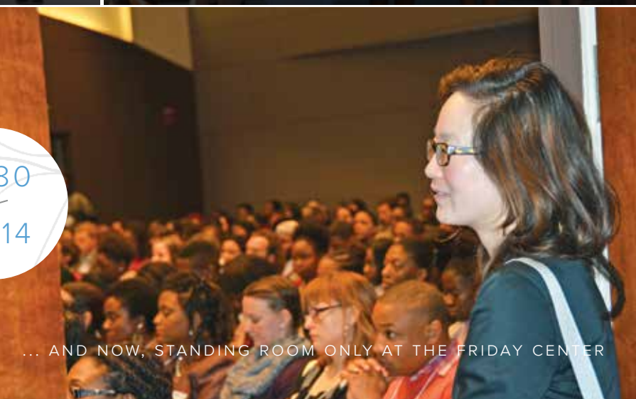
... AND NOW, STANDING ROOM ONLY AT THE FRIDAY CENTER