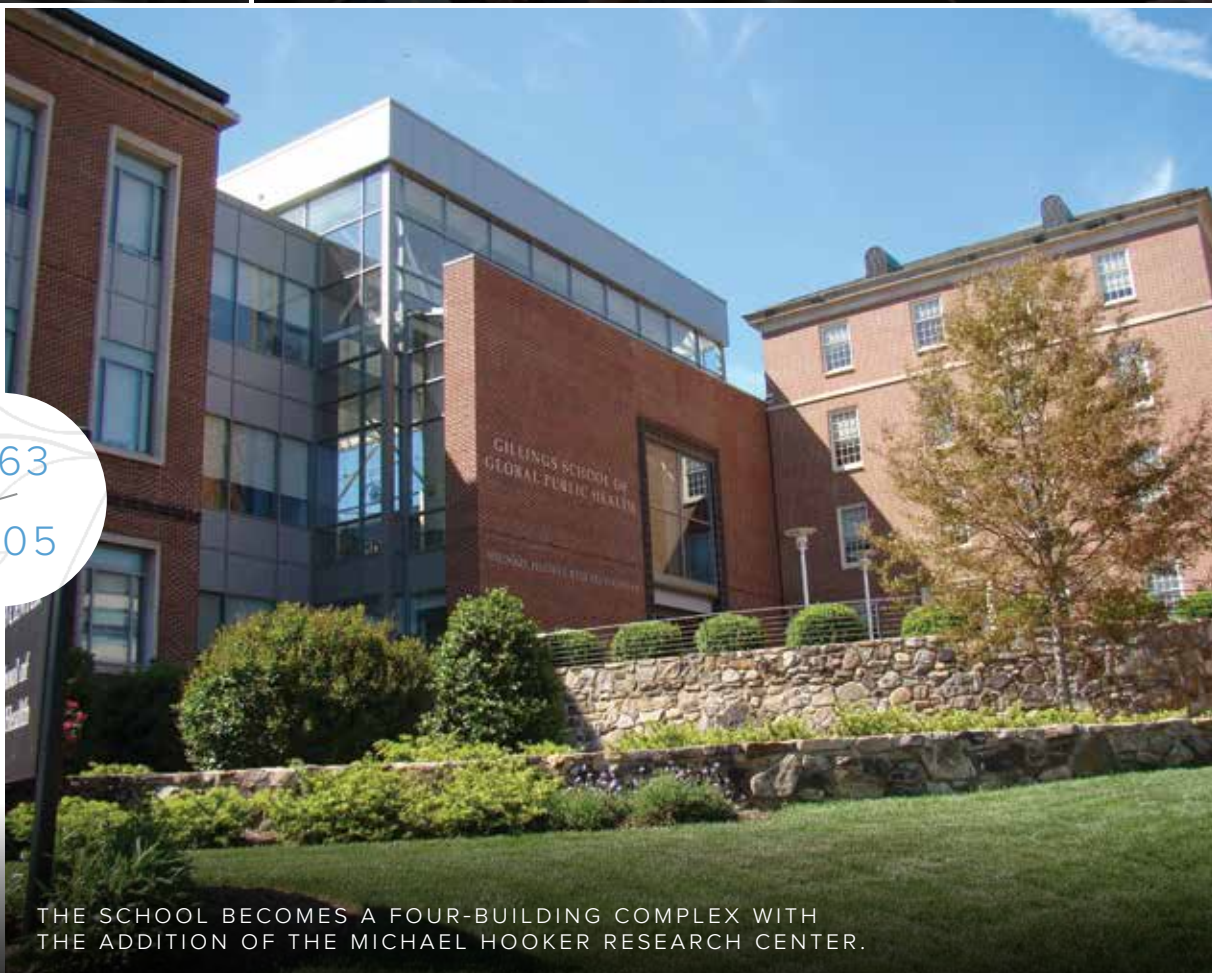
THE SCHOOL BECAME A FOUR-BUILDING COMPLEX WITH THE ADDITION OF THE MICHAEL HOOKER RESEARCH CENTER.