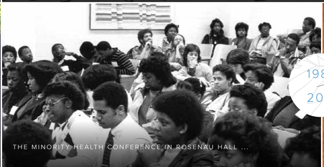
THE MINORITY HEALTH CONFERENCE IN ROSENAU HALL ...