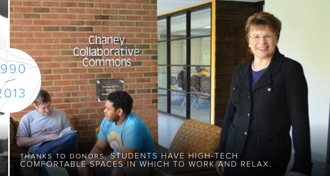
THANKS TO DONORS, STUDENTS HAVE HIGH-TECH COMFORTABLE SPACES IN WHICH TO WORK AND RELAX.