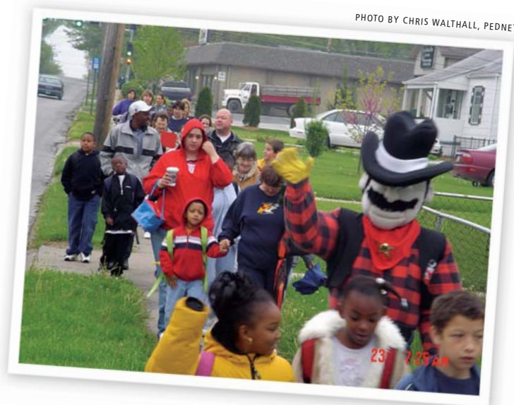
Elementary school students in Columbus, Mo., participate in “Walk-to-School Day” organized by the PedNet Coalition, a Columbia-area bike-ped advocacy and promotion group.