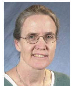
Dr. Alice Ammerman

issues associated with this growing national trend. “Among the most pressing public health problems in the U.S. today are obesity, environmental degradation, and health disparities,” Ammerman says. “Contributing in a big way to each of these problems is our current food system, with its heavy dependence on fossil fuels (fertilizers, pesticides, and gasoline) for large-scale production and long-distance transport of often high-calorie, nutrient-poor food.” Among other things, this project will help determine whether current consumer interest in locally-grown food can create an economic environment supporting small to mid-sized farms as viable enterprises, Ammerman says. The research will be conducted in North Carolina but will have national and international relevance.