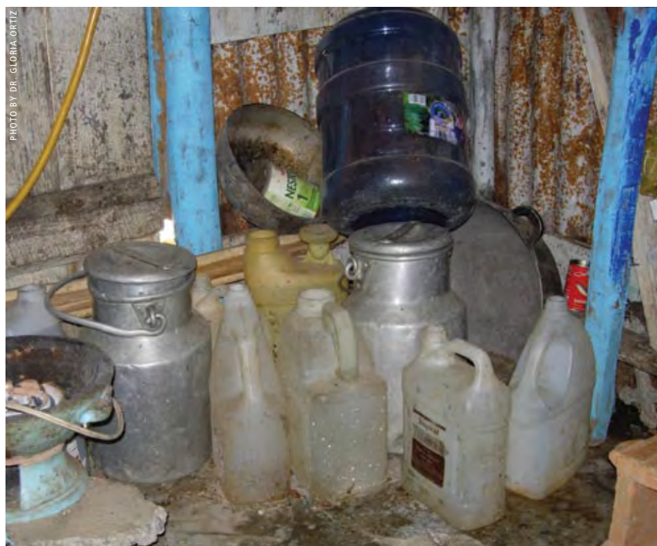
Plastic and metal containers (below) store unfiltered water in a Dominican Republic home. Water stored this way is prone to contamination. For this reason, biosand and ceramic water filters being tested by UNC researchers are designed so that filtered water flows into enclosed containers with side taps to dispense clean water.

“We’re conducting studies now to find out how long the pause time should be