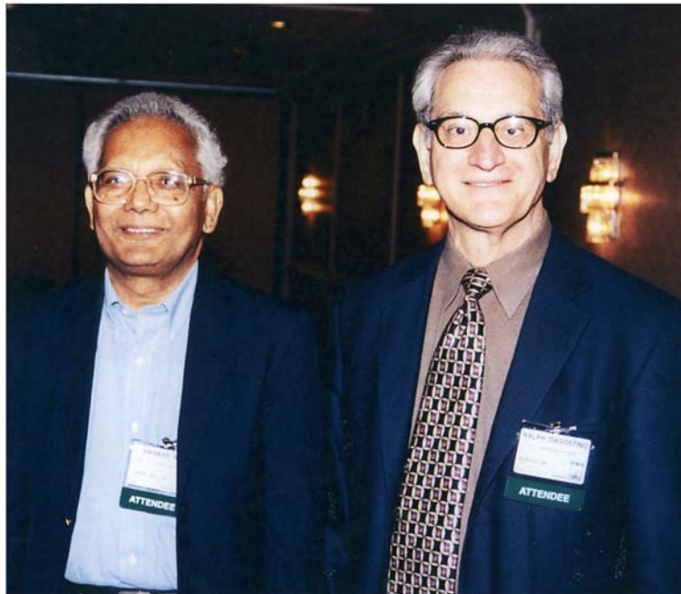
FIG. 8. Pranab Sen and Ralph D'Agostino at the Noether Lecture, Joint Statistical Meetings, 2002.

normality was not achieved. This inspired me to develop nonparametric methods for biological assays. The 1963 Biometrics paper (Sen, 1963a) was probably the very first nonparametric one in bioassay. I observed that because ranks are invariant under arbitrary strictly monotone transformations, an estimator of the relative