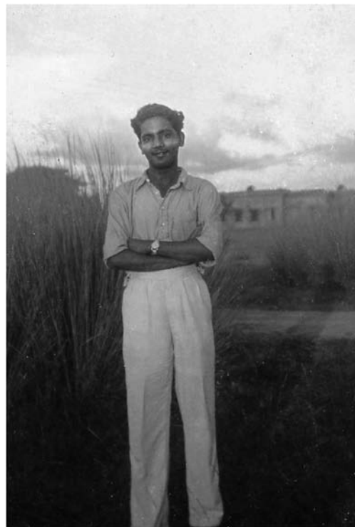
FIG. 2. While in Presidency College, Calcutta, 1954.