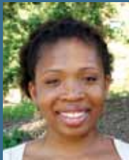
Obafunto Abimbola Public Health Leadership Program

Can make a difference in the lives of students like these