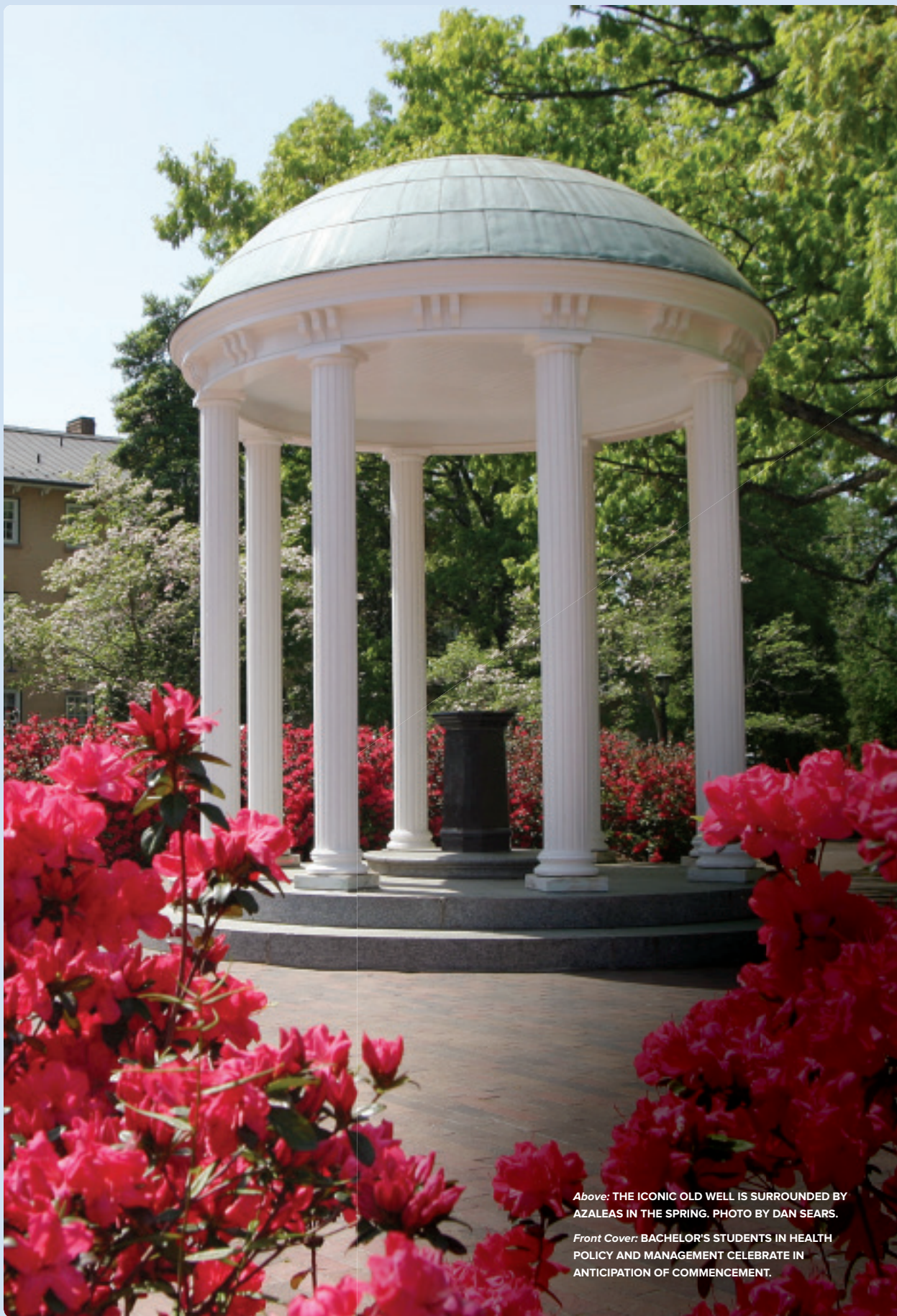
Above: THE ICONIC OLD WELL IS SURROUNDED BY AZALEAS IN THE SPRING.