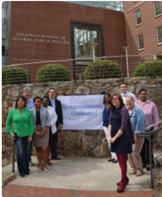
Above: THANKS FOR ALL YOU DO, STUDENT SERVICES MANAGERS!