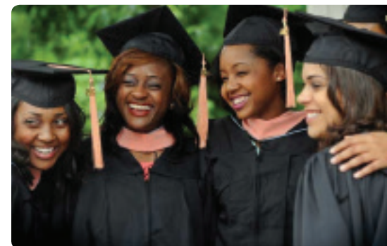
Left: OUR SCHOOL'S GRADUATES (PICTURED FROM 2013) ARE LOCATED ACROSS NORTH CAROLINA AND THE U.S.—AND IN MORE THAN HALF OF THE COUNTRIES AROUND THE WORLD.