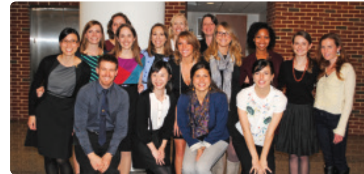
MASTER OF PUBLIC HEALTH STUDENTS IN NUTRITION WHO RECEIVED REGISTERED DIETITIAN (RD) CREDENTIALING ATTENDED A PINNING CEREMONY IN DECEMBER 2013.