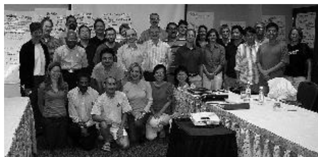
Biostatistics faculty in Wilmington, N.C.