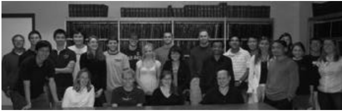
Biostatistics fall 2008 incoming class

The Department of Biostatistics welcomed the fall 2008 incoming class in August. Of 43 new students, 10 are enrolled in the BSPH undergraduate program, 13 in the PhD program, 5 in the DrPH program, 12 in the MS program and 3 in the MPH program. Our total number of students is 130 graduate students (70 PhD, 30 DrPH, 21 MS and 9 MPH) and 14 undergraduate students.