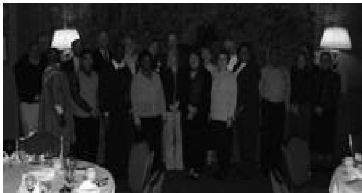
Biostatistics CSCC faculty and staff at UNC's Carolina Club