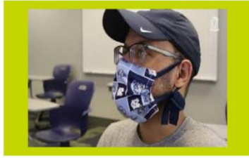
UNC GILLINGS SCHOOL OF GLOBAL PUBLIC HEALTH

Our time to make a difference. This is a public health moment. It is a frightening time, one in which no place is risk-free, but a time in which public health has critical skills to combat the pandemic in ways that are evidence-based, ethical and equitable. You will get the tools you need to make a difference to address the pandemic and whatever issues you choose as your career focus. You may make a discovery here or afterwards that saves millions of lives. Others have.